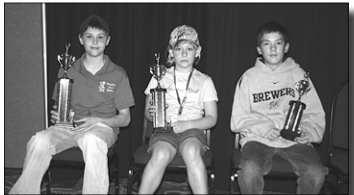
Cookie decorating contest winners.