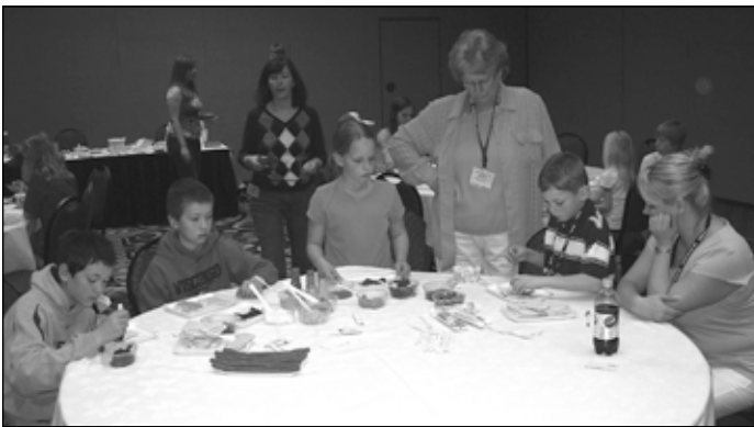
Cookie decorating at the children's program.